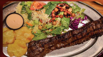
CHURRASCO A LA PARRILLA