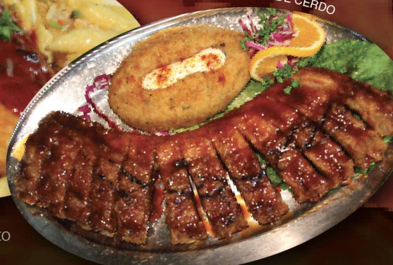
COSTILLAS DE CERDO

NO SE DIVIDEN CUENTAS WE DON'T SPLIT CHECKS