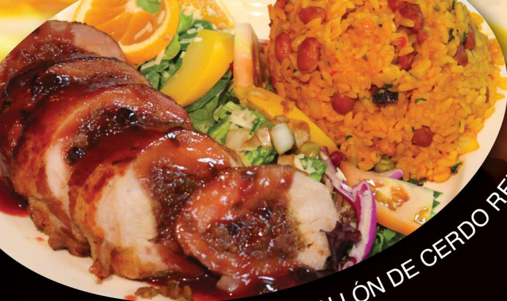
MEDALLÓN DE CERDO RELLENO