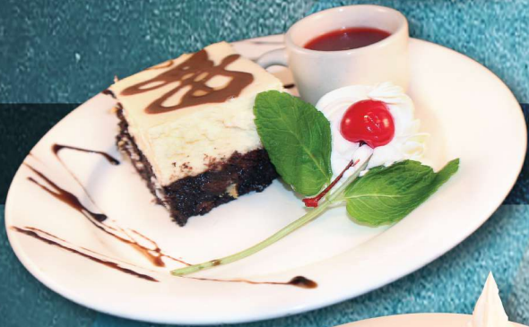
BROWNIE CHEESE CAKE