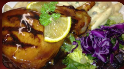
CHULETÓN DE CERDO