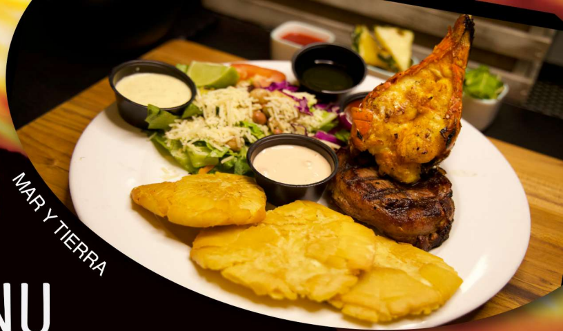
MAR Y TIERRA