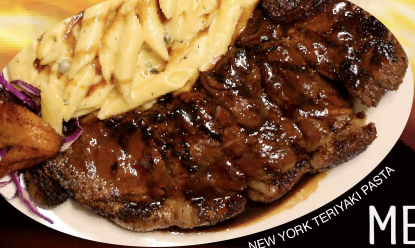
NEW YORK TERIYAKI PASTA