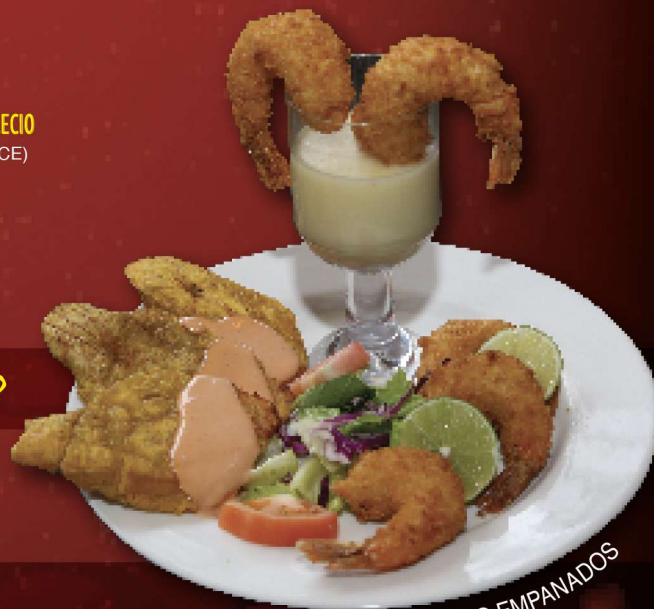
CAMARONES JUMBO EMPANADOS

ADVERTENCIA: EL CONSUMO DE CARNES, AVES, MARISCO, CRUSTACEOS Y MOLUSCOS, CRUDOS O POCO COCIDOS PODRIA AUMENTAR SU RIESGO DE ENFERMEDADES TRANSMITIDAS POR ESTOS ALIMENTOS; ESPECIALMENTE SI TIENE ALGUNA CONDICION MEDICA