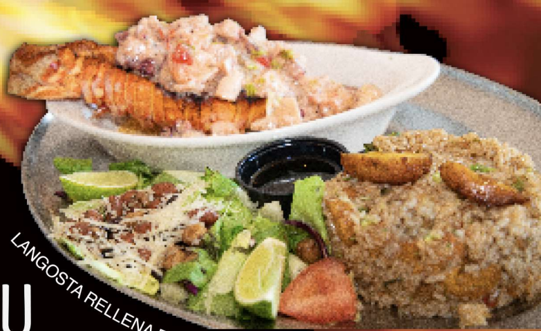
LANGOSTA RELLENA DE MARISCO