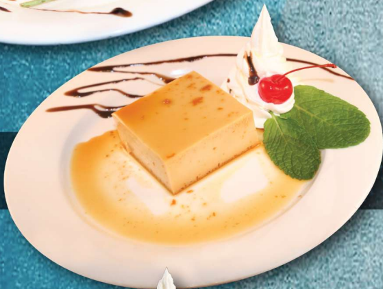
FLAN DE VAINILLA