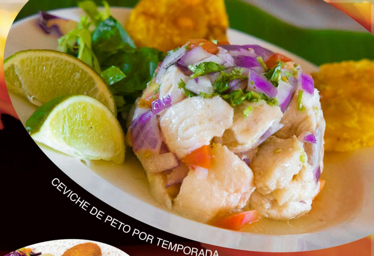
CEVICHE DE PETO POR TEMPORADA