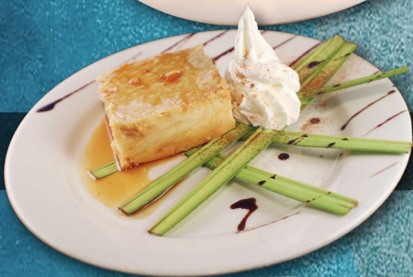
FLAN DE COCO