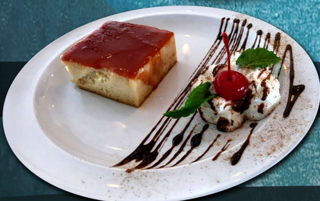
FLAN DE QUESO CON PASTA DE GUAYABA