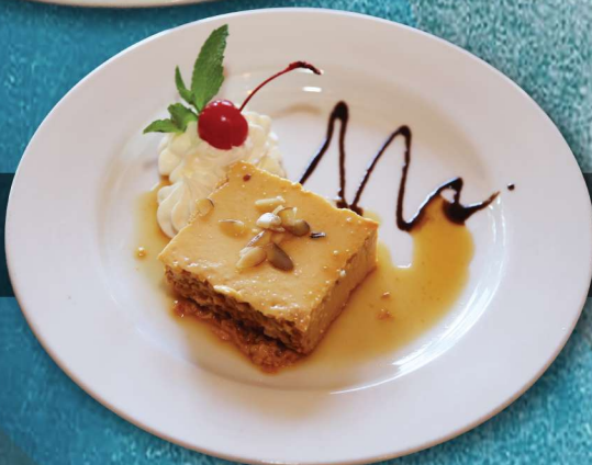
FLAN DE ALMENDRA