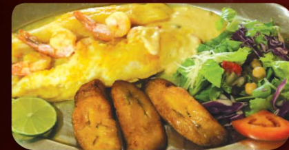
FILETE DE MERO RELLENO DE CAMARONES